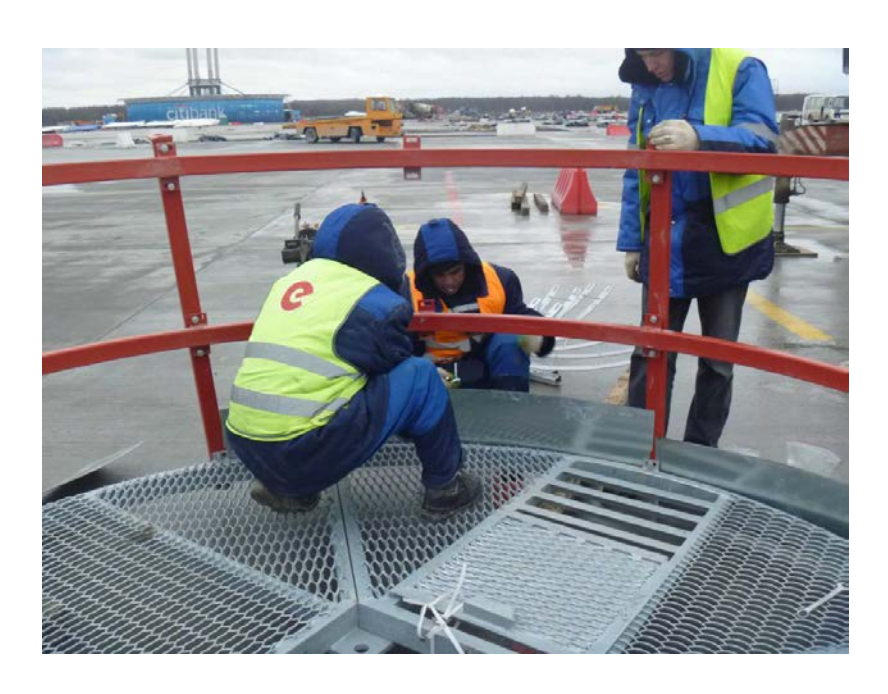
(According to the corporate newspaper "SVETskaya zhizn" \mathcal{N}_{2} 4 (25), 2013)